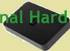
External Hard Drive